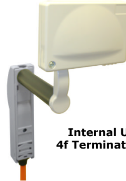
Internal Unit can attach to 4f Termination Box (as shown)

Prysmian Part No. – See Data Sheet WM001