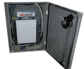
ROE 24 Master Plate inside an existing Telecom Italia Wall Box

Version with 48 adapters: Prysmian Part No. – XCPSC01507