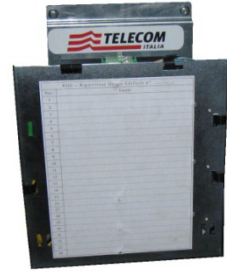
ROE 24 Master Plate

The Unit is suitable for Telecom Italia "Socrate" Wall Boxes line C and B (for this it's recommended an optional bracket) and for telecom Italia "ST 872" Wall Boxes.